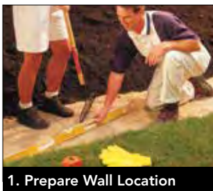
1. Prepare Wall Location

Start by digging a shallow trench 4" (102mm) deep by 12" (305mm) wide. Cut through and remove any sod, roots or large rocks. For organic loam soils, dig 4" (102mm) deeper and add a leveling pad of sand or gravel. Compact and level the soil to receive the first course of Keystone Garden Wall.