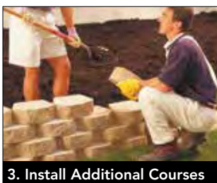
3. Install Additional Courses

Place and level the first Keystone Garden Wall unit. Level each additional unit on the base course as you place it, making sure that the outside edges touch. If your wall contains both straight and curved areas, start with a straight area and build into the curves. Complete the base course before proceeding to the second course.