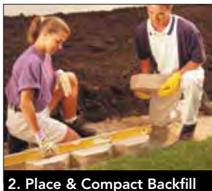
2. Place & Compact Backfill

Start by digging a shallow trench 4" (102mm) deep by 12" (305mm) wide. Cut through and remove any sod, roots or large rocks. For organic loam soils, dig 4" (102mm) deeper and add a leveling pad of sand or gravel. Compact and level the soil to receive the first course of Keystone Garden Wall.